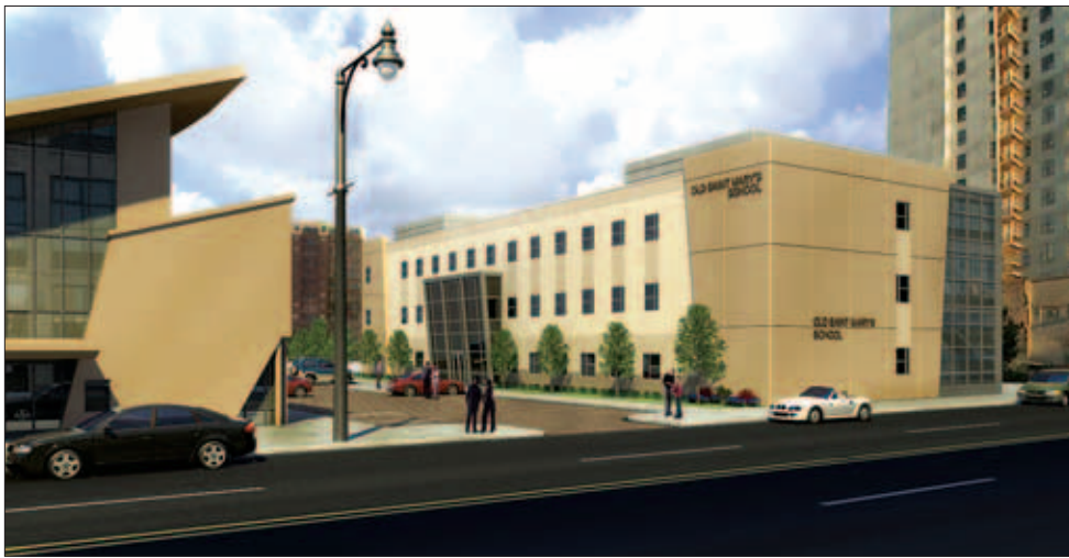
Artist's rendering of planned building at Old St. Mary's School, 1500 S. Michigan Ave. It will be built north of the existing church building. Image provided