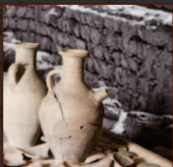
Exhibit pottery-Milwaukee Public Museum, image by Kathrine Berger