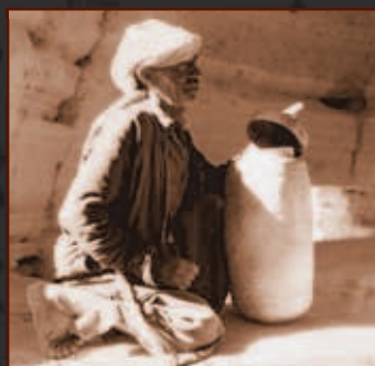
Bedonin and jar-Manchester Museum, The University of Manchester