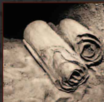
Copper Scroll